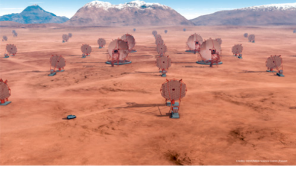
Figure 1. Artistic sketch of one of the two CTA sites. Several telescopes of different sizes will be deployed.

implementation strategy. In Sect. 5 we discuss the possible usefulness of having interchange of data between CTA and ground-based and satellite atmospheric monitoring networks. We end with a summary.