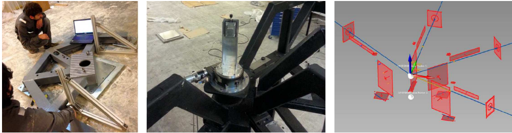
Fig. 1. From left to right: (a) balancer and plates during alignment; (b) detail of the Front End structure with the mode selector and the pentaprism; (c) Front End structure interfaces.