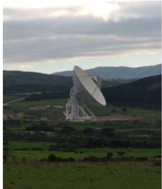
Figure 1. The mountain valley where SRT (in foreground) rises.

SRT is a general-purpose, 64-m fully steerable, quasi-Gregorian reflector antenna operated by National Institute for Astrophysics (INAF) and Italian Space Agency (ASI) [1]-[2]. Currently, SRT observes in the frequency range between 0.3-26.5 GHz with four dual-polarization cryogenic receivers for astrophysics research and space debris monitoring: an L-P band coaxial feed in primary focus; a K-band 7-feed-planar-array installed in one of the 7 positions of a rotating turret in charge of placing the receiver in the secondary (or Gregorian) focus; a C-high band feed in one of the four beam waveguide (BWG) focal positions (two for INAF receivers and two for the ASI ones). INAF is currently constructing two new dual-polarization cryogenic receivers to increase the coverage of the current operation frequency range: a 7-feed S-band for