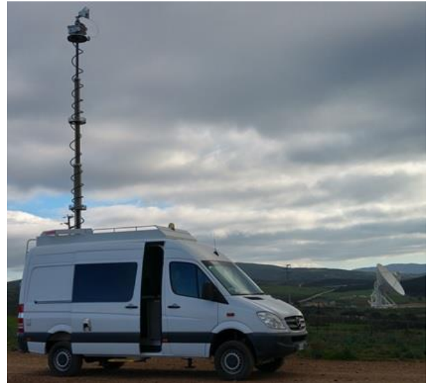
Figure 2. RFI mobile laboratory during an RFI monitoring at a measuring station close to SRT (in background).

Such RFI measurements around the telescope have allowed to characterise the frequency bands of the SRT working receivers and the under construction ones, as soon as their bands have been defined (see Table 1). This characterisation has turned out to be very useful for different reasons. First of all, it has allowed to extend the astronomical experiments to the frequencies beyond the RAS bands and to keep these latter clean, even reporting harmful RFI signals to the local authority when it was necessary. Then, it has provided astronomers with a case