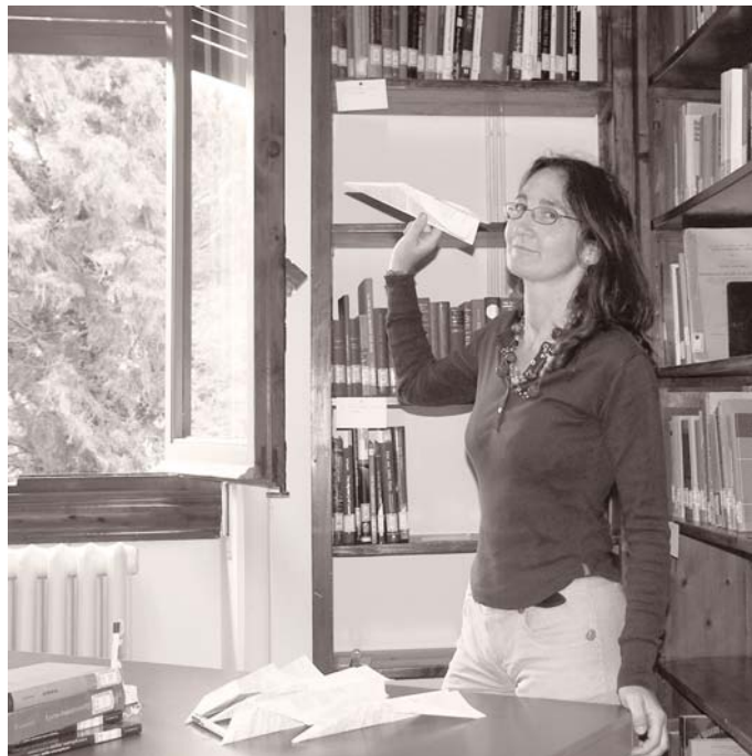
Figure 4. There is a better way to provide document delivery!

With NILDE the librarian's life is easier!