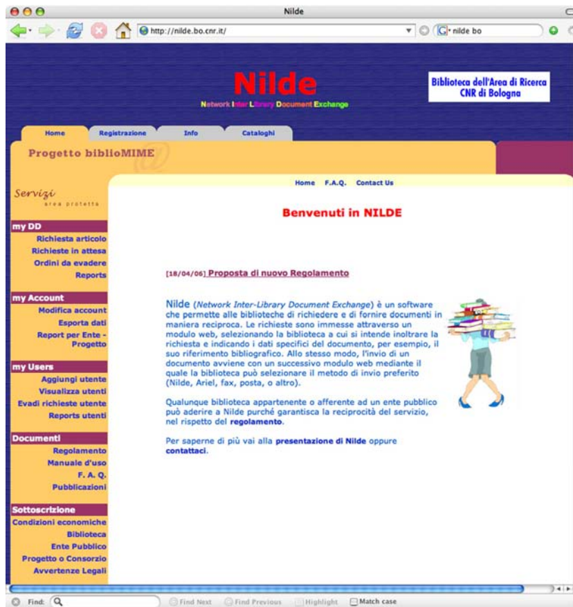
Figure 1. The NILDE home page.