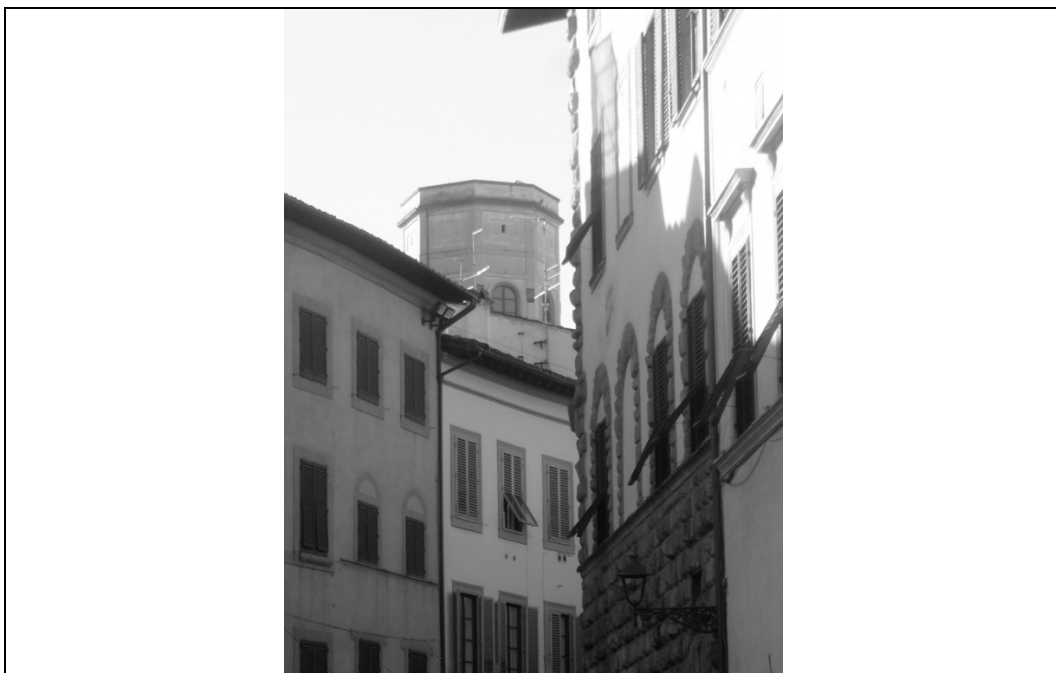
Fig. 2. The tower ( Torrino ) of the Florence Observatory ( Specola ) in Florence.

In 1858 a royal decree tried to fix the problem with a stricter regulation: the pendulum in Palazzo Vecchio 's telegraph office had to be regulated daily on the tower clock; the time had to be transmitted daily to other telegraph offices; private societies running the railway lines were compelled to use telegraph time (Giuntini 1991). Towns along railway lines were invited to use it for their public clocks. Still, Palazzo Vecchio 's clock was regulated on true solar time using the sundial of Piazza della Signoria , retraced on that occasion by the astronomers of Florence Observatory.