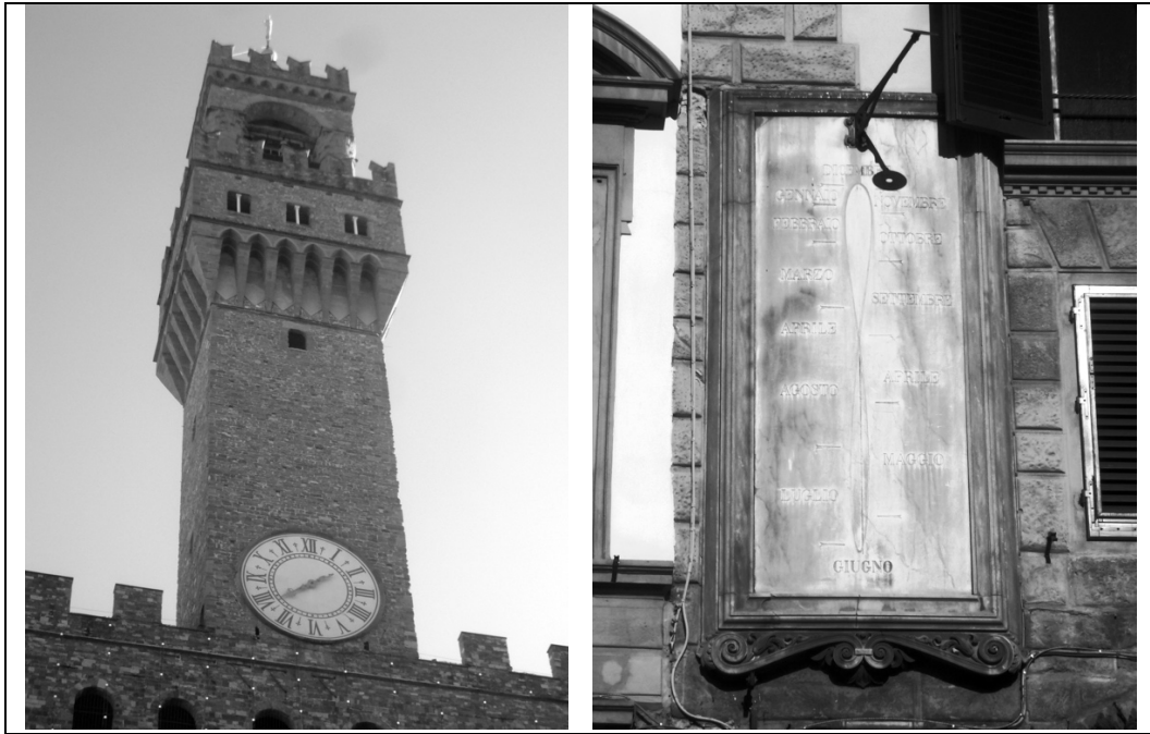
Fig. 1. The clock on the Tower of Palazzo Vecchio (left) and the sundial in Piazza della Signoria in Florence (right).

workshops. London followed in 1792, Berlin in 1810, Paris in 1812. The first city in Italy is said to be Naples, followed by Rome in 1847, and Turin and other towns in Piedmont in 1849.