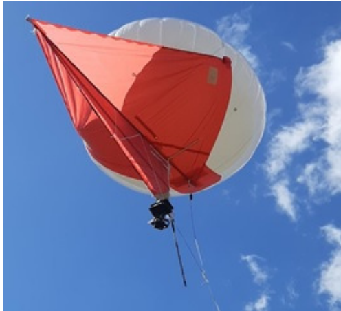
Fig. 1. Skyhook tethered Helikite.

tinuous and synoptic monitoring of vast areas of territory. This system allows continuous monitoring for long periods (months), with a greater level of spatial detail, which can be managed independently by the user according to their needs and with greater variety of data acquired. Other advantages are the improved time to costs ratio and no acoustic emissions. Furthermore, from the bureaucratic side, no licenses are required, just a clearance by the competent authority (NOTAM ENAC/ENAV ATM-05A). Moreover, it is easy to handle because it does not need an expert pilot.