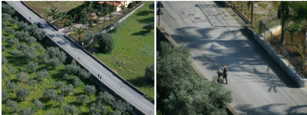
Fig. 3. Images acquired with no (left) and 30x zoom (right).

though with reduced performances due to both a lack of optical zoom and a lower resolution of the detector.