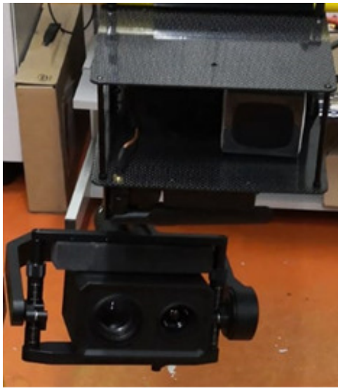
Fig. 2. Gimbal that hosts a HD VIS camera and an IR camera for night vision.

imaging camera, which adopts an uncooled microbolometer sensor with dimension of 10.88 mm x 8.704 mm, pixel size of 17 \mu m and a resolution of 640x512, able to get with its fixed optic, accurate measurements with calibrated temperature for each pixel in a spectral band ranging between 7.5 - 13.5 \mu m. Both cameras are mounted on an active gimbal that allows them to point towards the area of interest while continuously stabilizing them. To send the stream of the data, the platform is equipped with a 5.8 GHz digital wi-fi transmitter for the real-time monitoring through a ground station (tablet/smartphone/laptop). The gimbal is cur-