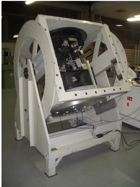
Fig. 2. The hexapod under test on a tilting device at ADS International srl premises (November, 2008).