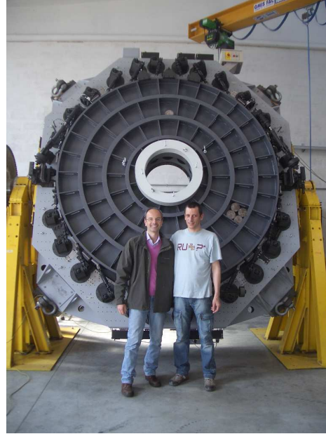
Fig. 1. The primary mirror system and two of the authors just before the shipment of the cell to Chile, at the end of a test session at Tomelleri srl premises (April, 2010).

The telescope error budget was revisited Schipani & Perrotta (2008a) and the concept of the primary mirror support and safety system (Fig. 1) was redesigned Schipani et al. (2010a), considering both performance and maintenance operations. The support system design, the control software Schipani et al. (2010d) and electronics Molfese et al. (2008a,b) were updated by INAF while the new mechanical parts were designed by Tomelleri srl under INAF requirements and supervision. The earthquake safety system has been designed in a common effort coordinated by INAF, that performed the analysis jointly with BCV srl and with the support from ESO Perrotta & Schipani (2010), while the mechanical design was committed to Tomelleri srl. In early 2009 the system was considered ready to be shipped jointly by INAF and ESO, but unfortunately a serious damage during the transportation caused a supplementary year of work in Italy, which has positively terminated with successful system tests on April, 2010 Schipani et al. (2010c). The damage shifted the schedule of the overall project exactly by one year, causing a new manufacturing and qualification test of the whole system and also of extremely critical (for their function and poor accessibility) components of the telescope, i.e. the custom made primary mirror supports. This came to be not just a mere repetition of the work previously done: the replacement of some obsolescent commercial com-