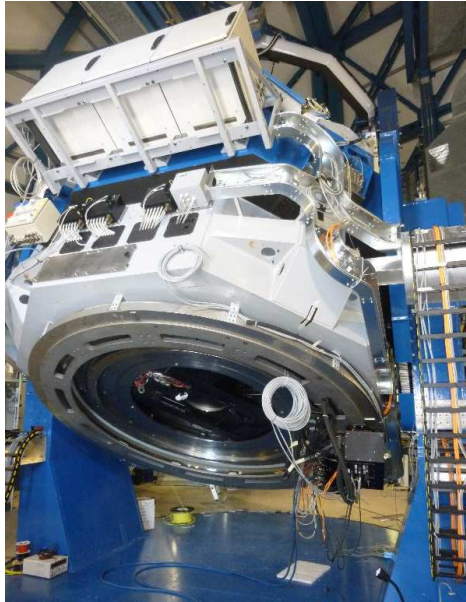
Fig. 4. The primary mirror cell integrated in the telescope (September, 2010). In the bottom part the guide probe is visible, as well as the technical CCDs controllers and the co-rotator control cabinet.

an increasing interaction with the OmegaCAM team, facing several interface problems and establishing a fruitful collaboration.