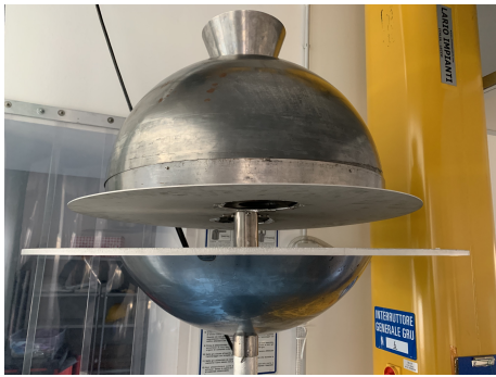
Fig. 1. Zoom in, on the top part of the system, the shape recalls the planet Saturn.

In order to obtain an efficient disinfecting device, the combination of the UVGI disinfection lamps in a reflective cavity is a clever approach. In this context, Saturno is a project in collaboration with NVK Design of Natasha Calandrino Van Kleef, which took care of the design and the INAF. Because of its shape, the sanitification lamp gets its name from the planet Saturn (fig1).