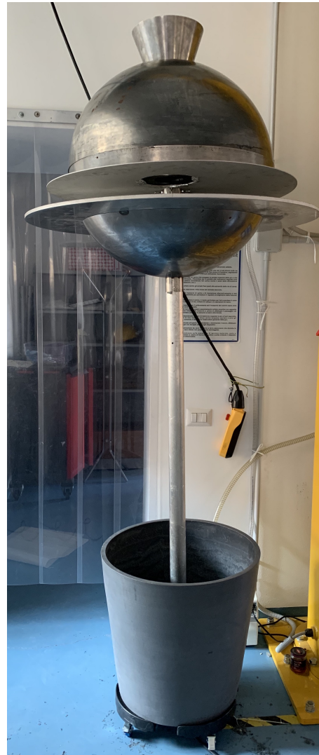
Fig. 2. Picture of the whole system, including the pole, the vase and the base with wheels.

The Saturno lamp has been designed to aspire the air into the top semi-sphere by two fans. The air flows inside the top half, where 4 UV-C mercury lamps irradiate