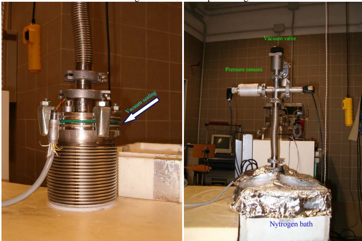
Fig. 1 The small chamber used in the tests(left) and a view of the vacuum setup (right). Also the pump is visible behind the Nitrogen bath.

An ad-hoc hermetic small chamber was designed for this test (Fig. 1). In this way the samples mounted inside the chamber do not get in touch with liquid Nitrogen.