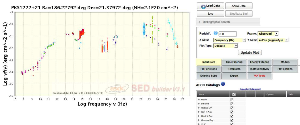
Figure 4. The SED BUILDER tool interface

The SED Builder (Fig.4) is a web based program developed at the ASDC to produce and display the SED of astrophysical sources. The tool combines data from several missions and experiments, both ground and space-based, together with catalogs and archival data. Proprietary data can also be properly handled. Based on a Java code and a MySQL database system, the ASDC SED Builder provides different functionalities and several plot options for the analysis of the SEDs.