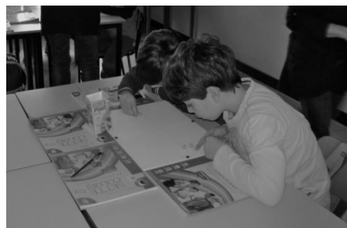
Fig. 1 “Operators” at work, sampling the image through the holes of the peg

In each group, 2 of the students (the “operators”) are given a peg board with a colour image under it: they have to use the board as a colour sampler, inserting pegs of corresponding colours in the holes, in order to make the image recognizable to their friends (Fig.1).