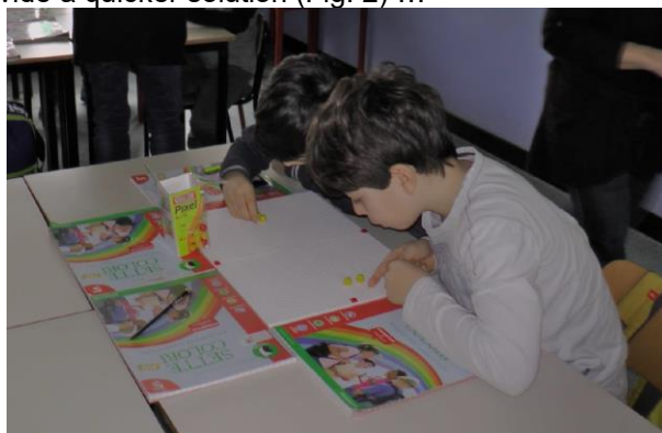
Figure 1 Children starting to put pegs in the pegboard