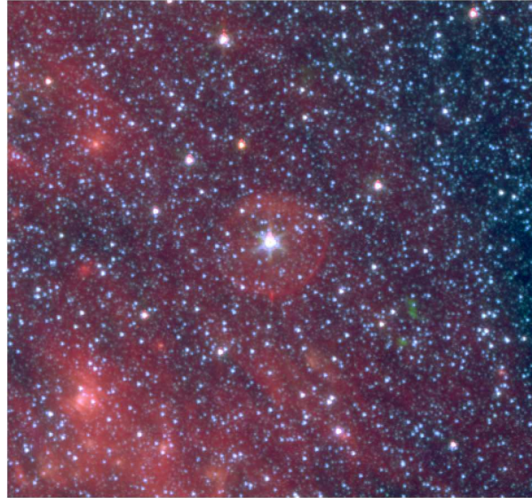
Figure 1: IRAC composite image of Wray 17-96 with north up and east to the left, FOV = 5'' . Emission from the central star is evident at 3.6\mu\text{m} (blue), while the warm dust is well traced by the 8.5\mu\text{m} (red)