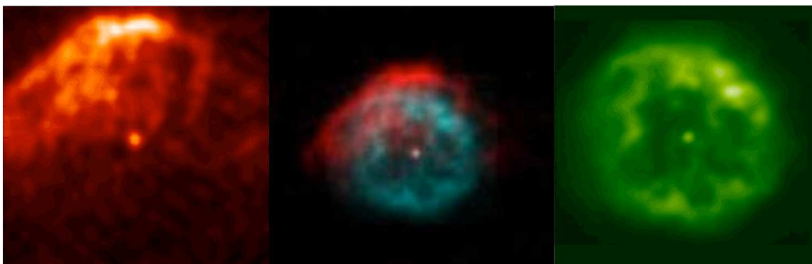
Figure 2: Center: multi-configuration 6-cm VLA map (red) superimposed on the 11.26- \mu\text{m} VISIR map (blue) of IRAS 18576+0341. Both maps have north up and east to the left. The center image is 20'' across. A zoomed (FOV 8'') of the VLA map (left) and of the VISIR map (right) are also shown (adapted from Buemi et al. 2010).

Many interesting results have been obtained from our imaging and spectroscopic program. In particular, extended dusty shells have been detected around some of our targets (see Fig. 1) and evidence for asymmetric mass-loss and of possible mutual interaction between gas and dust components is suggested by the comparison of VLT/VISIR and VLA images of the more compact nebulae. The analysis of the mid-IR spectra has provided information on the gas and dust composition, allowing identification of the mineral composition of LBV ejecta and to discriminate between crystalline or amorphous dust components. Moreover, the presence of low-excitation atomic fine structure lines points out the existence of a photodissociation region (PDR), an extra component of neutral/molecular gas that should be taken into account when one determines the total budget of mass lost by the star during its LBV phase. We present examples of our results in the following sections. More details can be found in a series of papers devoted to the project.