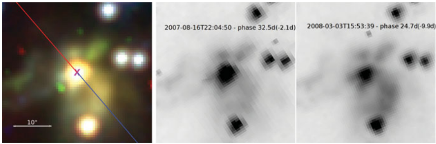
Figure 2. Left - IRAC RGB image (channels 3, 2, 1) of G107 (cross). The line indicates the rotation axis of the circumstellar disk and the sense of the outflow (red-/blue-shifted). See online paper for color figure. Center/right - 4.5\ \mu\text{m} images for the two epochs at phases of 32.5 and 24.7 d, respectively. The out of phase variability of the YSO and the nebulosity is obvious.

new maser components and their projected separation a lower limit to the propagation speed of the excitation could be derived for the first time which amounts to \sim 0.15c . There are several possible reasons for the subluminal velocity. Since the energy transport by photons rests on absorption and re-emission as well as scattering, it will become slower at increasing optical depth. The heating of dust beyond the snow line will be delayed by the endothermic sublimation of volatiles frozen onto grains. Dust growth in the dense YSO environment will have a similar effect due to the increase in grain heat capacity.