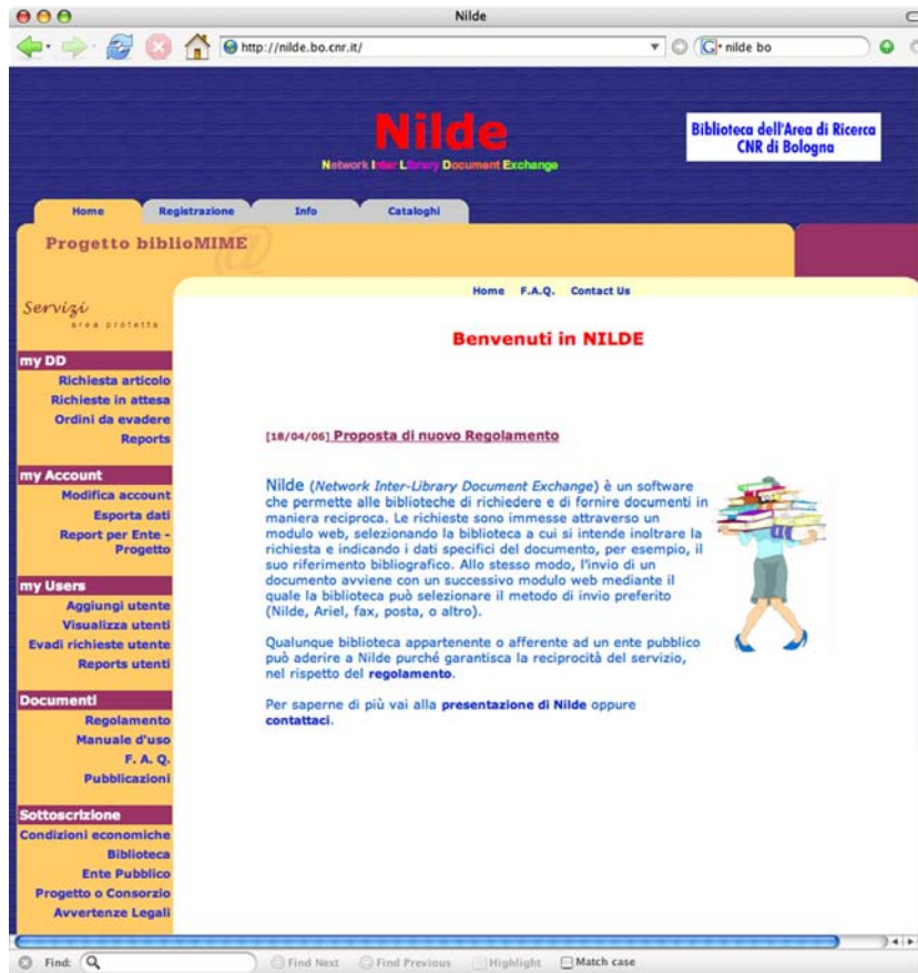
Figure 1. The NILDE home page.