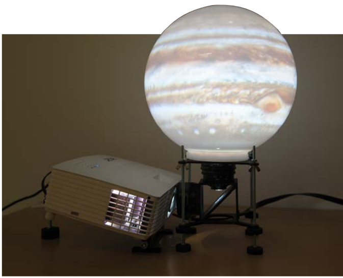
(a) 2 (above left) Planets in room set up in sphere configuration, useful to show planetary data.

2 (above left) Planets in room set up in sphere configuration, useful to show planetary data.