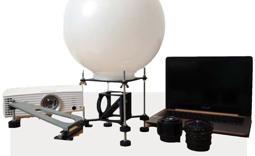
4 The 3D printed components, left, and their assembly (right).

with different projectors and in different conditions. With the help of the software interface, the projector and optical system can be adapted in the calibration phase and all the physical parameters of the system can be set up in the best configuration for each session. The chosen calibration can then be recorded and used until PIAR needs to be moved.