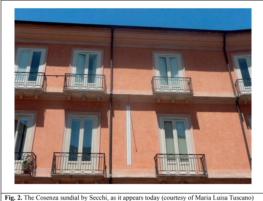
Fig. 2. The Cosenza sundial by Secchi, as it appears today

the people came out to welcome him, like in a sort of public festival. These demonstrations confirmed how popular he was, on account of his outreach activities, his involvement in public works and his name being most reported in newspapers.