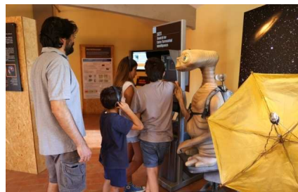
Fig. 8. The HORSE exhibit with ET close to it.