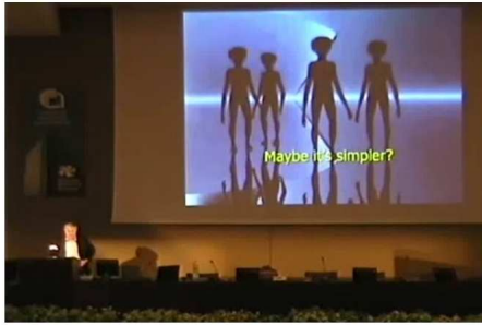
Fig. 1. Seth Shostack in Bologna in 2010.

involved in that research project. During all these years, we have faced some behaviours and beliefs that, according to us, can be pinpointed as the main risks of SETI research being misinterpreted or mixed up with something else.