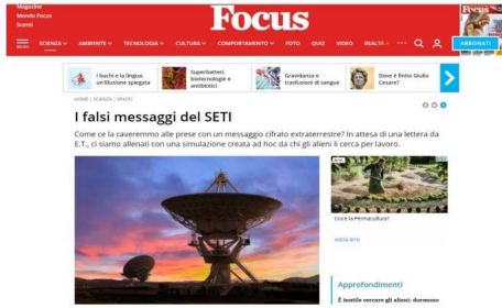
Fig. 3. A page of the Italian magazine Focus, telling about some possible messages received within the SETI project, which went real ET signals.