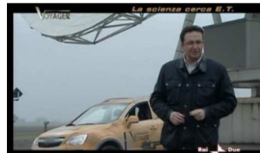
Fig. 2. A scene of the episode aired on February 25th 2009 of the Italian telecast Voyager.

When public research is involved, the confusion between SETI and pseudo-scientific or non-scientific themes is certainly risky in terms of explanation of how the funding for the research is used in the first place. Not telling anything, especially being this such attractive