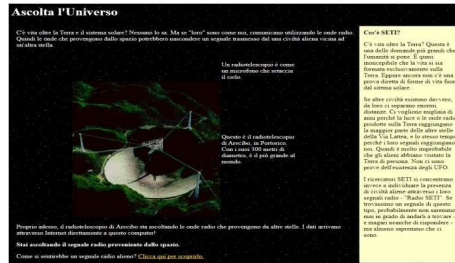
Fig. 7. The Hands-On Radio SETI exhibit at the visitor center of the Medicina radio telescopes.

largely considered, because of the reputation of the program (that would mean a lot of work of scrutiny and check-up of the contents) and in order to preserve the research infrastructure from the possible backfire of incorrect or equivocal communication. But this would have possibly meant being named during the episode as the ones that did not let us in, as if they are hiding something. Within the broad framework of the fear for a conspiracy, many people do believe that the discovery of a SETI signal would not be communicated to the public and would instead be kept secret, or even covered in lies 2 . The great advantage about