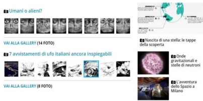
Fig. 4. At the bottom of page shown in Fig.3, some "daydream" stories about UFOs, apparently considered relevant to the topic of the above article.