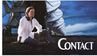
Fig. 6. The poster of the movie Contact, 1997, telling about the discovery of an ET signal with the Very Large Array of radio telescopes in New Mexico.

and troublesome topics, could anyway be interpreted as hiding something. Appearing within a big TV telecast as Voyager in Italy implied reaching two million watchers at once, explaining what SETI is, against the roughly five thousand people per year visiting the radio astronomical station. Nevertheless, the possibility of not accepting the visit of the presenter and the authors of the telecast has been