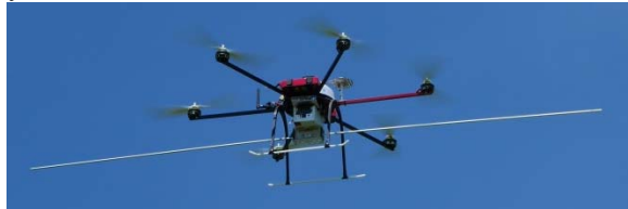
Figure 1: UAV-based flying test source. The payload consists of a GNSS receiver, an RF generator and a dipole antenna.

Besides providing valuable data for the validation of the EM models of the aforementioned antenna systems, these campaigns have also been instrumental to further develop the UAV-based measurement system and associated procedures to the level of maturity required for validation of larger systems.