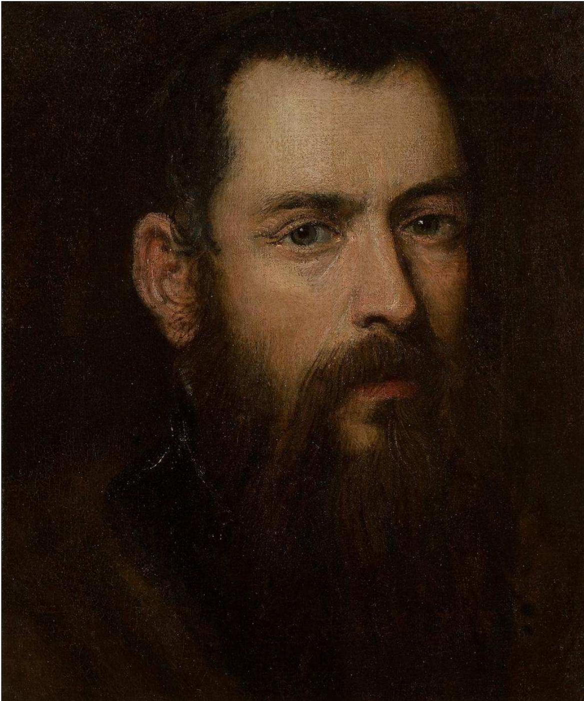
Figure 2: Portrait of A Bearded Man , attributed to Tintoretto (Museum of Medieval and Modern Art, Padua, Inventory number 772).

not feel obliged to produce an entirely-faithful reproduction of the Santi di Tito's painting. Therefore, he likely decided to draw a direct reproduction onto the copper matrix, without reversing the image first. In doing so, the face of Galileo would be turned from left to right in the final printing process. This modus operandi simplifies the design. It is interesting to follow the mole on the face of Galileo. In the Padua painting the mole is either not present in the painting or partially hidden on the shaded side