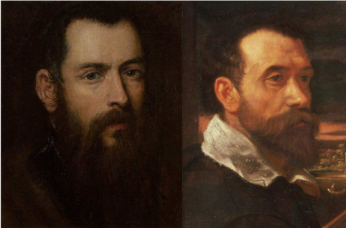
Figure 5: A comparison of A Bearded Man (left) and one of the individuals in Rubens' Self Portrait with Friends in Mantua now in the Wallraf-Richart Museum in Cologne.

Padua painting next to the detail of the Cologne one to emphasize the several similarities between the two portraits once the different styles of the two painters are taken into account. Santi di Tito was the last representative of Tuscan Mannerism at the end of his life, while Rubens was at the start of his career and at the dawn of the Baroque age.