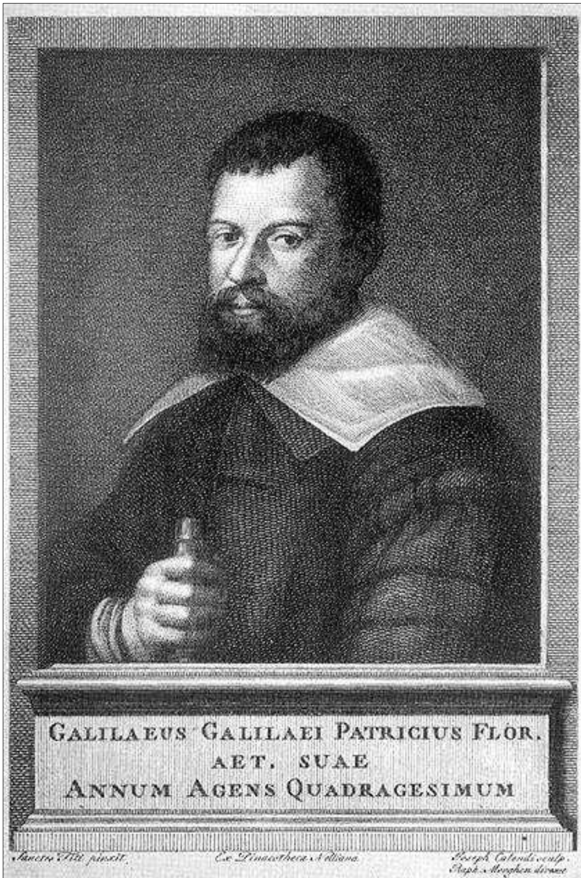
Figure 1: Giuseppe Calendi's engraving after Santi di Tito on the frontispiece of Vita e Commercio Letterario di Galileo Galilei , by G.B.C. de Nelli (1793).