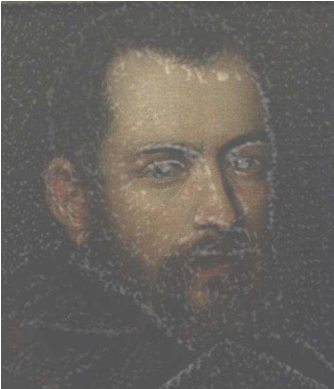
Figure 4: Overlay of the negative of Calendi's engraving inverted horizontally and the Padua painting, with a reduced opacity to highlight similarities and differences.

Courtauld Gallery, London, where a natural sky is depicted. Reeves (1999) connects Rubens' Cologne painting with Galileo's Lectures on the nova of 1604 and a possible Stoic and anti-Aristotelic interpretation of the natural world. Lipsius (1547–1606) was the founder and most representative neo-Stoic philosopher, and although he was not present in Mantua, he appears in the painting together with his followers, including Rubens' brother Philippus and two other students (ibid.). It was a subject that Rubens elaborated again in the painting of the