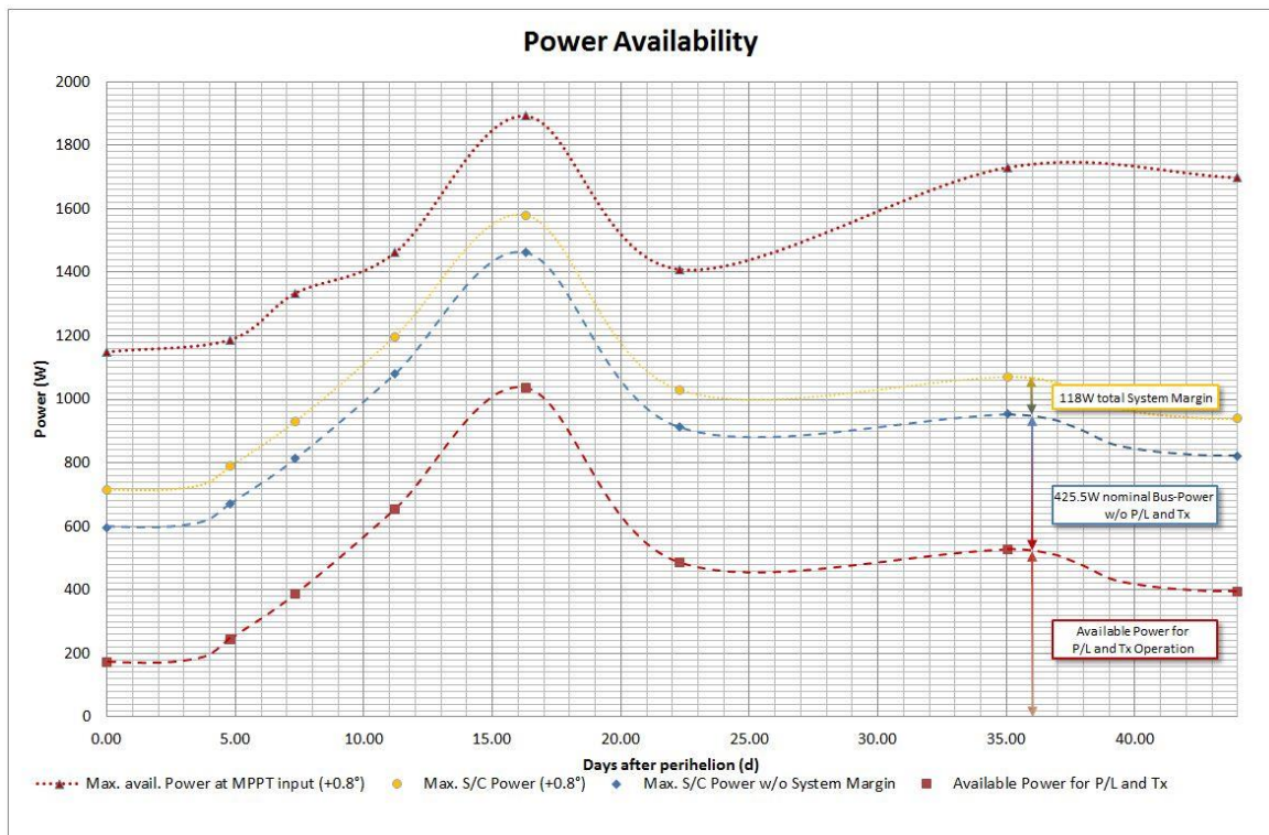
Figure 1 shows the power availability at perihelion currently provided in Astrium documentation (see BC-ASD-TN-00424 [RD.05] for details).

That constraint has to be taken into account when planning the observations around perihelion, taking into account the thermal aspect, which together will drive the experiments that can be on in this season.