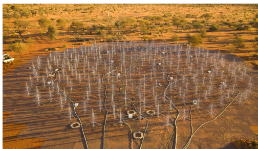
Figure 1. An aerial side view of the AAVS2 array, November 2019.

The AAVS2 (also known as AAVS2.0) verification system consists of an array of 256 dual-polarized log-periodic SKALA4.1 antennas, distributed on a wire-mesh ground plane. More details on this antenna may be found in [2]. The maximum centre-centre distance between antennas is 38 m and the array layout is semi-random; some antenna positions have been fine-tuned to avoid mechanical interference and a reasonable walk-through to access every antenna. The demonstrator was deployed at the Murchison Radio-astronomy Observatory (MRO) site during the course of 2019; a picture of the completed array is shown in Fig. 1. One of the main drivers behind its construction was to address the issue of array calibratability. Two single-ended 50-ohm Low Noise Amplifiers are fully integrated in each antenna and are connected through coaxial cables (10-m long) to a box where the RF signals are pre-conditioned and converted for transmission via optical fibers to the central processing unit.