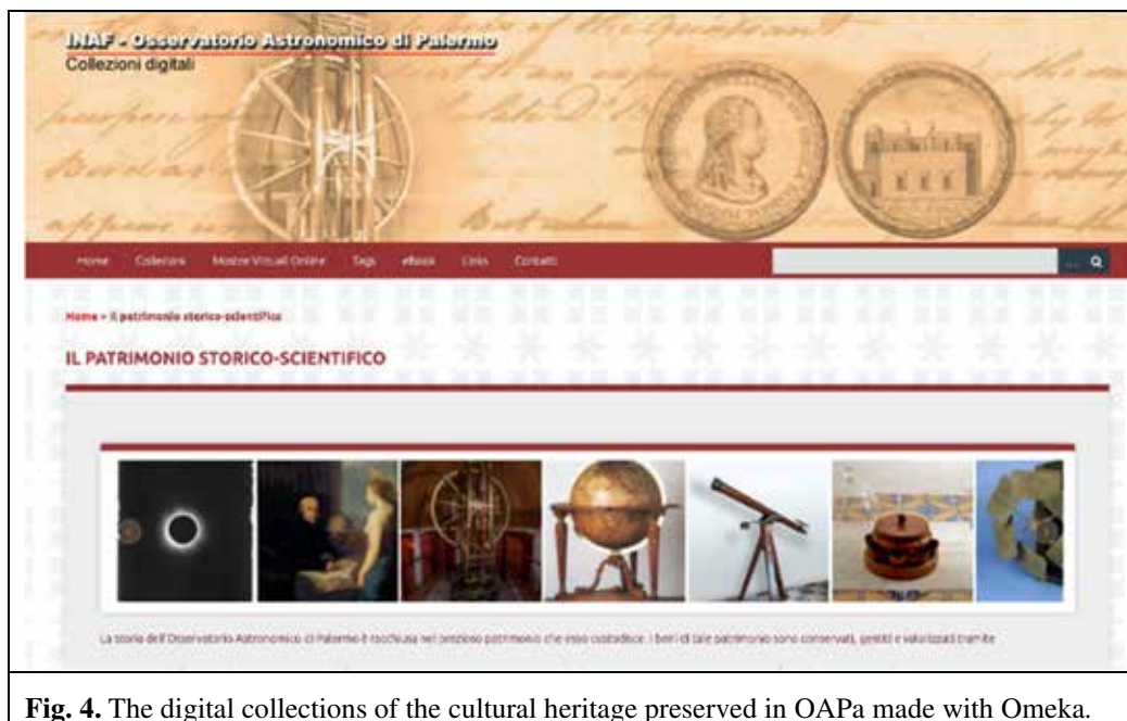
Fig. 4. The digital collections of the cultural heritage preserved in OAPa made with Omeka.

With the Dublin Core as a resource description standard, Omeka has the advantage of offering full interoperability with major cultural metadata aggregators, such as Europeana. 12 Its information architecture is based on two essential elements: the document (item), and the collection. Each item in a synthetic form offers essential information, provided with internal links to other items of collections present on the platform and to other external online resources available, including the catalog cards present on the INAF 'Polvere di Stelle' portal or the 3D resources shown above. In this way, Omeka can be configured as a real dynamic virtual museum. Another important function available on Omeka is the creation of virtual exhibitions with the items already cataloged on the platform, which follow itineraries that can be divided into sections and enriched with textual descriptions. Furthermore, the images and main information relating to each single item can be easily shared on the main social networks. Work on the Omeka platform is constantly in progress, as it is continuously enriched in terms of resources and connections (see: http://starlod.astropa.inaf.it/ ).