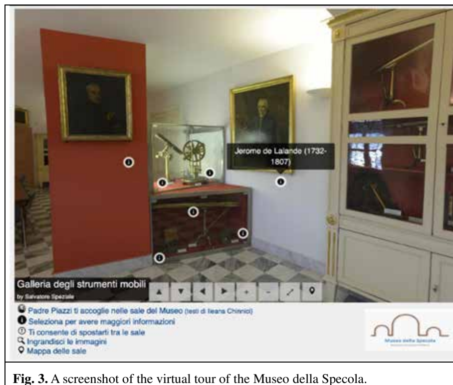
Fig. 3. A screenshot of the virtual tour of the Museo della Specola.

In 2019 we started thinking about making a virtual tour of museum and then to publish it on the web to virtually open it to the public and schools even during the pandemic. We used the technique of photogrammetry with a high-resolution camera to photograph instruments and rooms, to create usable 3D objects and import them into an open source javascript library for the visualization, and to carry out the perspective conversion from a curved image to a flat image on the monitor. The virtual navigation (Fig. 3) gives the possibility to move between the rooms, accompanied by a narrator and supported by a map, text boxes and a menu and to get closer to the historical items collected. In many cases, we inserted high-resolution navigable photos to see the most minute details of some instruments (see: http://virtuale.oapa.inaf.it/SpecolaVirtuale.html ).