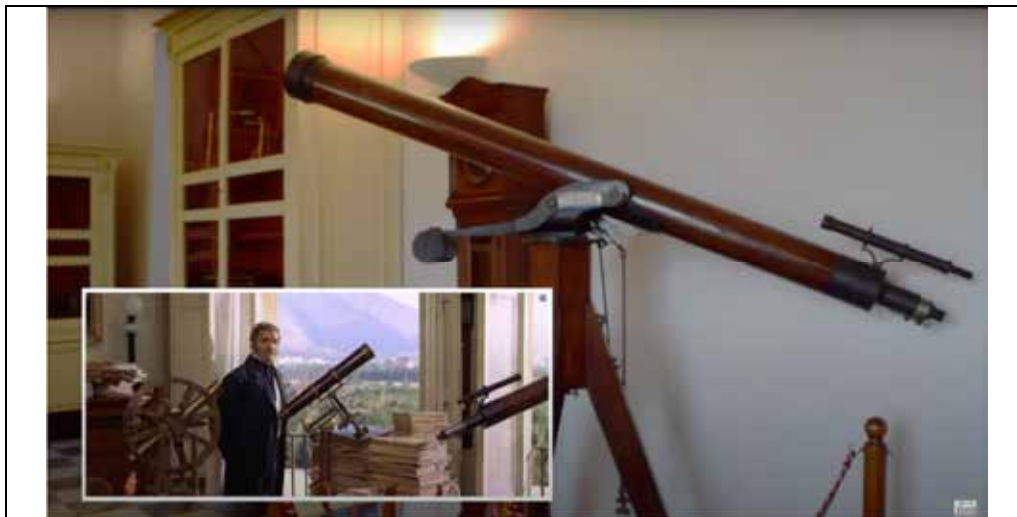
Fig. 2. One of the Leopard’s Telescope in the video for the ATS Virtual Conference in 2020.

In November 2020 Ileana Chinnici (astronomer at OAPa - her main field of research is history of 19th-century astronomy) was asked to illustrate a virtual tour of the Museo della Specola 2 for the Antique Telescope Society (ATS) Virtual Conference (Fig. 2). In this occasion, the OAPa made a video with augmented and virtual reality effects to present the museum and its collections and share scientific information with other scholars and researchers. In March 2021 the Scientific Instrument Commission (SIC) hosted a virtual visit to the Museo della Specola 3 . With the use of a multimedia product with AR/VR effects, Ileana Chinnici shared with other scientists a selection of interesting items collected in the museum.