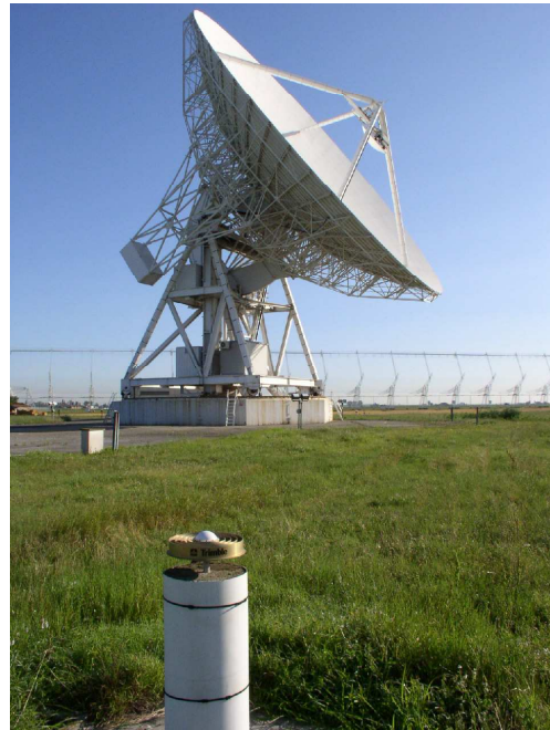
Figure 1. The Medicina (Bologna) VLBI telescope: an AZ-EL 32 m steerable antenna mount whose twin telescope is located in Noto (Siracusa). In the foreground of the picture the IGS GPS antenna co-located with the VLBI telescope is visible.

The frequency operability spans the range 1.4–22 GHz for Medicina telescope and 0.3–43 GHz for Noto telescope. The two telescopes perform observations with receivers located in primary or Cassegrain focus. Insights on technical characteristics of the two telescopes can be found on