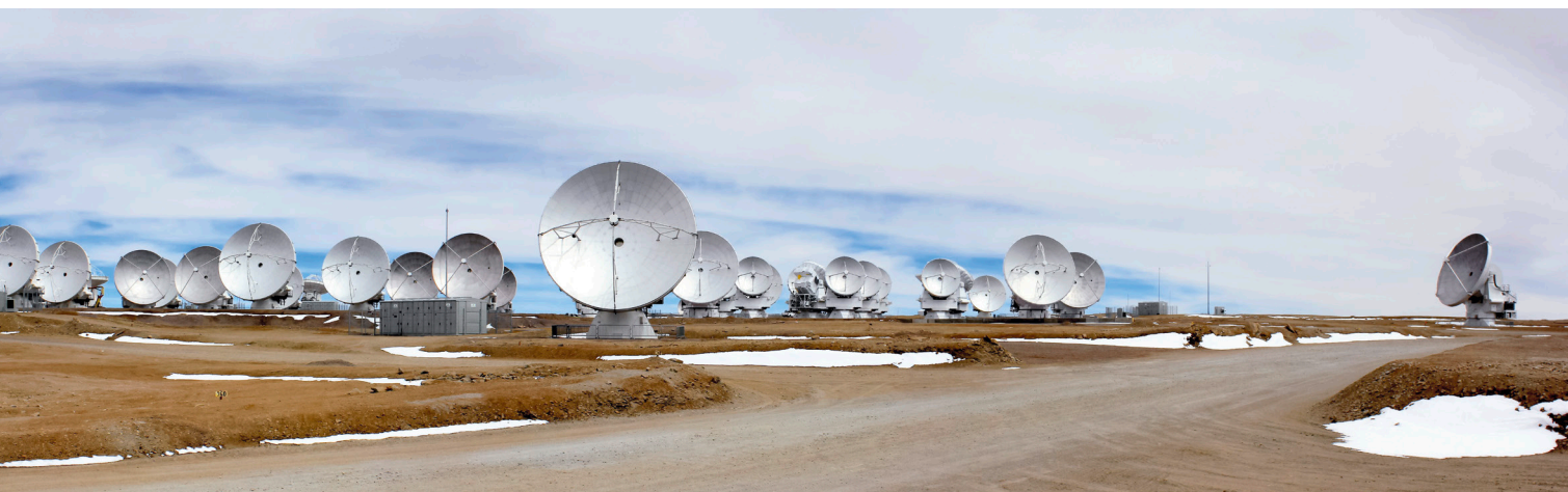
Figure 3. A panoramic view of ALMA antennas on the Chajnantor Plateau.

The weakness as well as the strength of the ARC network lies in its heterogeneous structure: nodes have different organisations, funding schemes, community size and expertise, and — perhaps