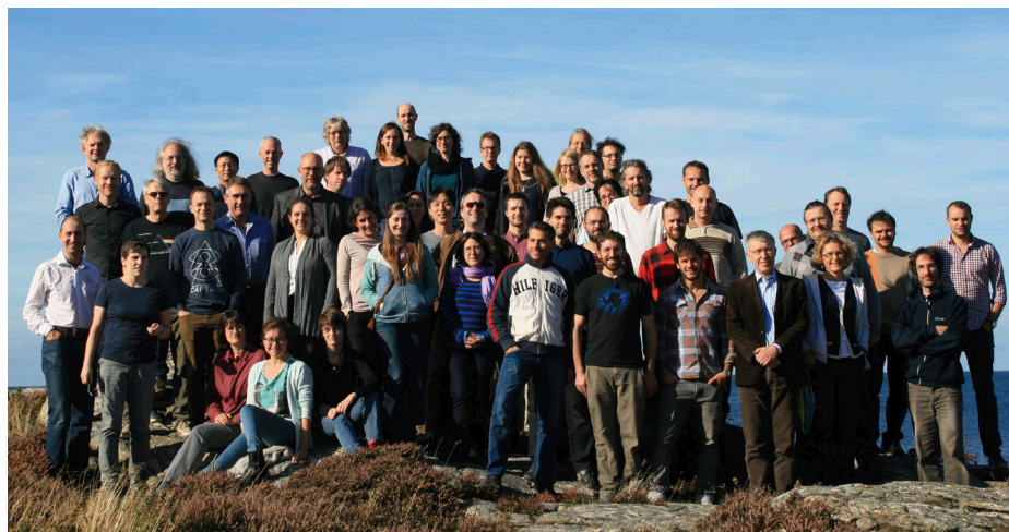
Figure 2. Many of the staff of the nodes of the European ARC pictured during the most recent all-hands meeting in Smögen, Sweden, 28–30 September 2015.

Rather than having formal or legal agreements, the ARC network partnership is based on the Memorandum of Understanding, but above all on trust and collegiality. This collaboration, that at first sight may seem vulnerable, functions well because of its symbiotic nature: through the ARC nodes ESO is able to