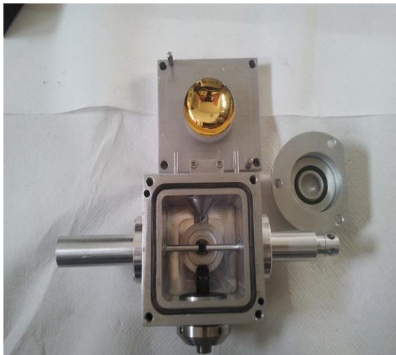
Figure 1: MicroMED Breadboard.

the instrument. This is related to grain size via scattering models. The run duration has been tuned in order to acquire about 400-2000 particles depending on dust concentration. This will allow to obtain enough statistics to sample the dust size distribution. The system has been designed in order to work up to particle concentrations of several hundreds \text{cm}^{-3} before coincidence effects become significant. The estimated fraction of coincidences goes from 0.01% (constant haze) to < 4\% (dust devil).