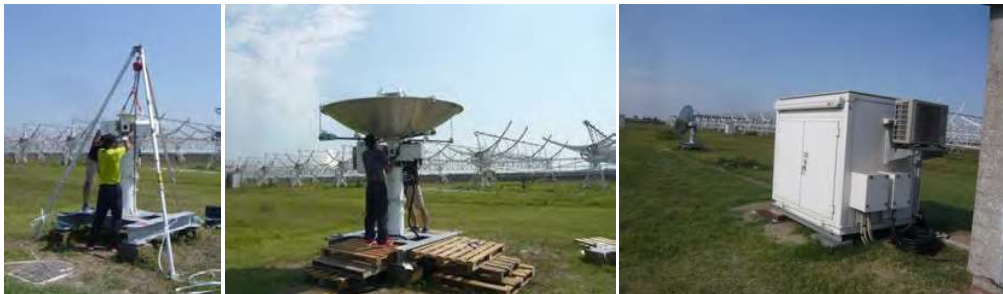
Fig. 2: Installation of transportable VLBI station at Medicina. The transportable 2.4 m antenna consists of separate assemblies for the dish and Az/EI drive system. Three persons are sufficient to assemble the system in two days of work (Left and Center). A small air-conditioned box, located 30 m from the antenna, contains antenna control system(right).