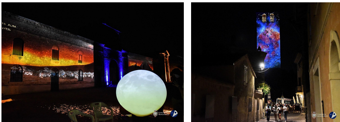
Figure 3: Wall mapping projections. Left panel: facade of Villa Arrighi. Right panel: the bell tower of Castellaro Lagusello.