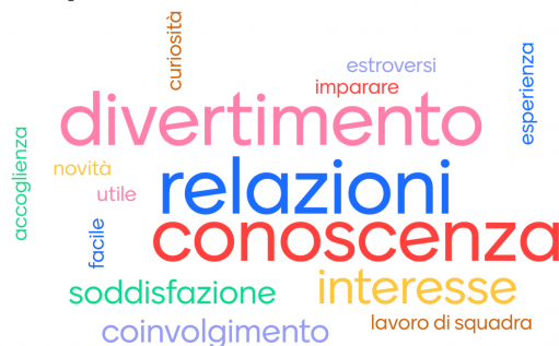
Figure 6: Word clouds obtained by asking the high-school students who delivered the workshops during the Festival. Top panel: word cloud obtained before the training “From this experience I expect...”. The most repeated words are “knowledge”, “interest”, and “learn”. Bottom panel: word cloud obtained at the end of the Festival “From this experience I have obtained...”. The most repeated words are “relationships”, “knowledge”, “fun”.

Festival achieved the goal to transmit astronomical contents, but it also helped to create a network between peers, a fundamental achievement in that age range and in this historical period (Figure 6).