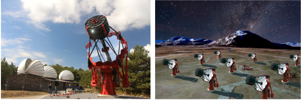
Figure 1. Left panel: the ASTRI SST-2M prototype at the Serra La Nave observing station. Right panel: Artistic concept (not to scale) of the ASTRI mini-array.

a factor of ten the sensitivity in the energy range 0.1–10 TeV. Finally, 70 small size telescopes (SSTs, primary mirror D \sim 4 m, A_{\text{eff}} \sim 5\text{--}10 \text{ m}^2 ) covering about 10 \text{ km}^2 will enhance Galactic plane source studies in the energy range beyond 100 TeV. A detailed review of the CTA project is given in [4].