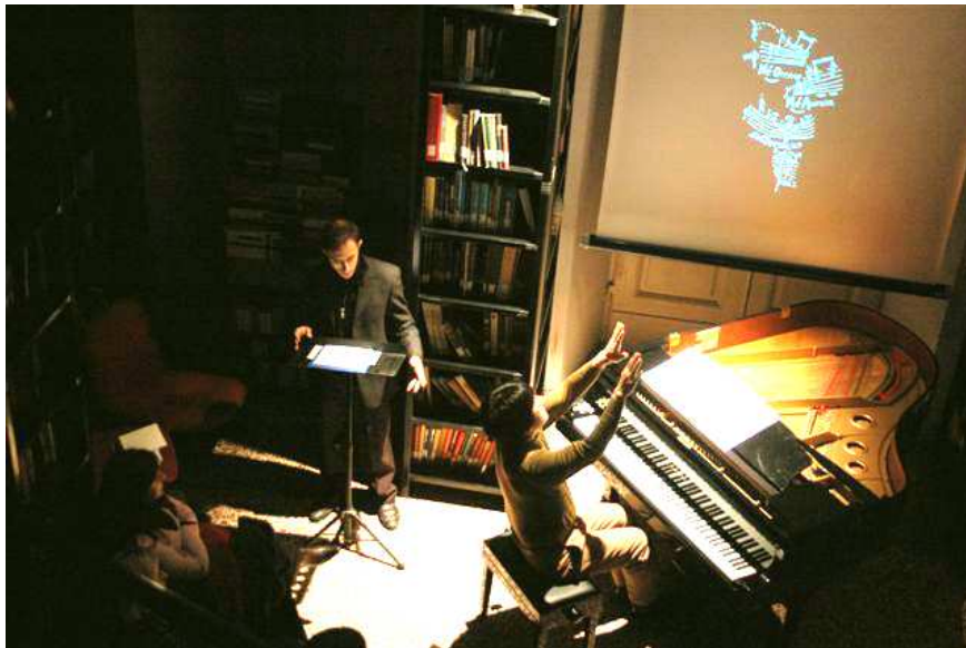
Figure 1. Music and Astronomy: a concert in the Library 7/12/2008

These actions concern the culture and the mindset of librarians and the perception of libraries both in research and academic centres. The essay maintains that “Libraries and their staff will become increasingly important as navigational guides, helping users make discerning choices among materials available in the public domain on the Internet.” 7 Libraries must evolve from a context which is perceived as the domain of books to a broader environment for the academic community, a hub of interaction in research institutions as well as an open and friendly space linking to local and public environments. They must perceive themselves as part of a wider cultural system providing access to (and validation of) scientific knowledge to the public.