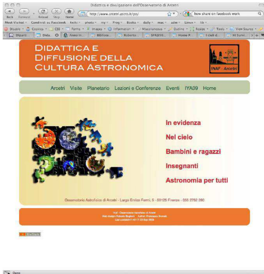
Figure 3. The web page of the Arcetri Public Outreach site

This new “broader” function has some positive aspects also for the institution which hosts the library because it acquires more visibility in the social and cultural context. This is the reason why the directors of observatories and research centres are motivated to support these projects.