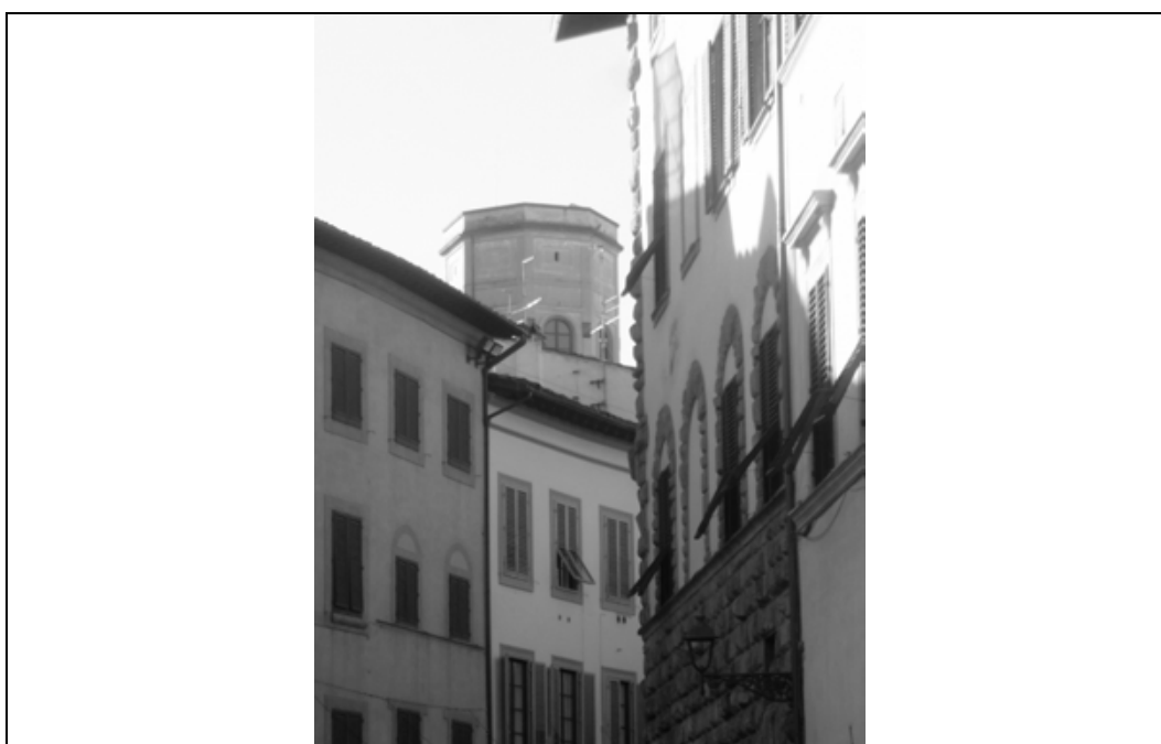
Fig. 2. The tower ( Torrino ) of the Florence Observatory ( Specola ) in Florence.

In 1858 a royal decree tried to fix the problem with a stricter regulation: the pendulum in Palazzo Vecchio 's telegraph office had to be regulated daily on the tower clock; the time had to be transmitted daily to other telegraph offices; private societies running the railway lines were compelled to use telegraph time (Giuntini 1991). Towns along railway lines were invited to use it for their public clocks. Still, Palazzo Vecchio 's clock was regulated on true solar time using the sundial of Piazza della Signoria , retraced on that occasion by the astronomers of Florence Observatory.