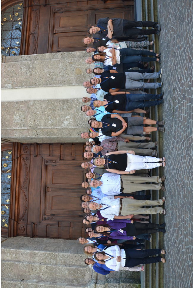
Fig. 1: Conference picture.