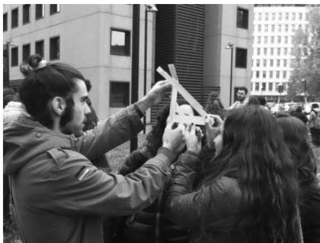
Figure 1. Outdoors activities: learning how to use a quadrant.

In the laboratory, students first explored the properties of light, in particular the characteristics of the shadow produced on a screen behind an object in relation with the position and extension of the light source. These experiences helped them to construct the straight-lines model of light, useful for interpreting astronomical observations, like day and night alternation. The straight-lines model was then used for interpreting reflection and refraction phenomena. The second part of the laboratory was dedicated to the analysis of astronomical phenomena, like the length of day and night at different latitudes, the characteristics of lunar phases in relation to the Earth, Moon and Sun's relative positions. For these explorations students used light sources and spheres as physical models for representing the Earth and the Moon (see figure 2).