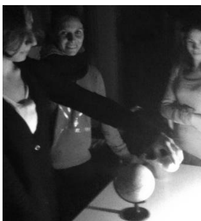
Figure 2. Modeling the Earth-Moon-Sun astronomical system.

In the laboratory, students first explored the properties of light, in particular the characteristics of the shadow produced on a screen behind an object in relation with the position and extension of the light source. These experiences helped them to construct the straight-lines model of light, useful for interpreting astronomical observations, like day and night alternation. The straight-lines model was then used for interpreting reflection and refraction phenomena. The second part of the laboratory was dedicated to the analysis of astronomical phenomena, like the length of day and night at different latitudes, the characteristics of lunar phases in relation to the Earth, Moon and Sun's relative positions. For these explorations students used light sources and spheres as physical models for representing the Earth and the Moon (see figure 2).