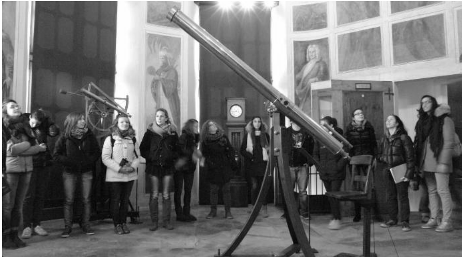
Figure 5. Students looking at pictures and listening narratives related to important astronomers of the past in the Figures Room, Museum La Specola .

The visit ended in the Figures Room (figure 5), where eight life-size full-length portraits of famous personages in the field of astronomy are painted all around the walls. They are, in chronological order: Ptolemy, Nicolaus Copernicus, Tycho Brahe, Galileo Galilei, Johann Kepler, Isaac Newton, Geminiano Montanari and Giovanni Poleni. The students were told about the scientific activity of these personalities, whose contribution to the development of scientific knowledge and the evolution of cosmological models was fundamental.