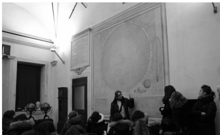
Figure 4. The fresco in the Meridian Room showing the Solar system before 1781, Museum La Specola .

Reinforcing what had been shown at the Museum of the History of Physics, the Meridian Room provided the students with another practical example on how the Scientific Revolution implemented the new methodology of knowledge both through observation and experimentation, and through the central role of instruments.